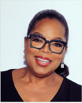
OPRAH WINFREY MEDIA PERSONALITY East Nashville High School CLASS OF 1971