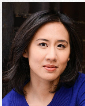
CELESTE NG AUTHOR Shaker Heights High School CLASS OF 1998