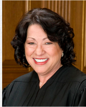
JUSTICE SONIA SOTOMAYOR SUPREME COURT JUSTICE Cardinal Spellman High School CLASS OF 1972