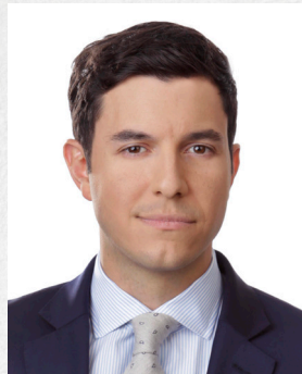
TOM LLAMAS NEWS ANCHOR Belen Jesuit Prep School CLASS OF 1997