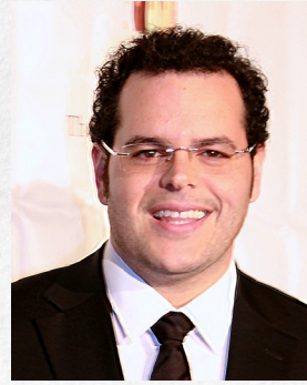
JOSH GAD ACTOR NSU University School CLASS OF 1999