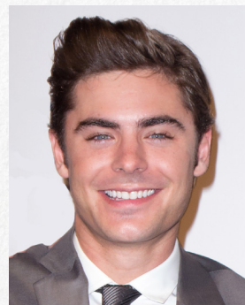
ZAC EFRON ACTOR Arroyo Grande High School CLASS OF 2006