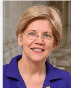
ELIZABETH WARREN POLITICIAN Northwest Classen High School CLASS OF 1966