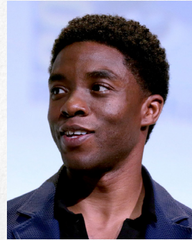
CHADWICK BOSEMAN ACTOR T. L. Hanna High School CLASS OF 1995