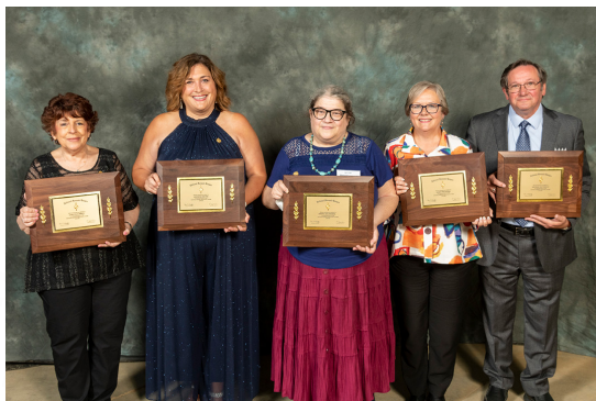
2022 NATIONAL SPEECH & DEBATE ASSOCIATION HALL OF FAME INDUCTEES

https://www.dropbox.com/sh/li6qw1q786h8uen/AADrITJEvxa2hu5BDwWWOuma?dl=0